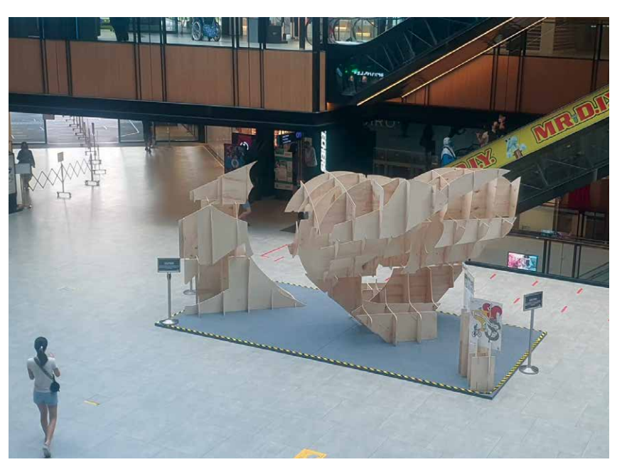
URA-REDAS Spark Challenge design submission showcase at the SingPost Centre Mall

quarter of the financial year, allowing for the public to collect free N95 and surgical masks.