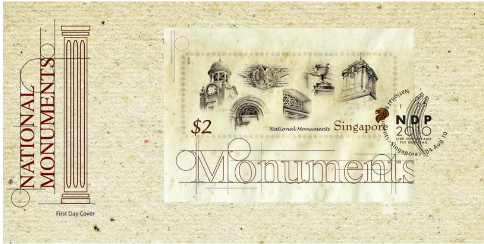
Pre-cancelled First Day Cover affixed with miniature sheet (Price: S$2.75)