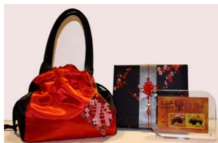
Zodiac Ox Gift Set consisting of a magnetic acrylic frame with a Zodiac Ox Collector's sheet