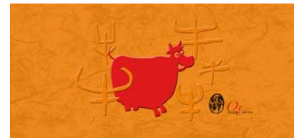
Presentation Pack (S$3.75)