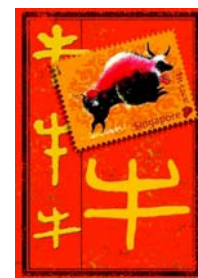
Free designer hongbaos with every purchase of the Collectors' Sheet

Singapore, 8 January 2009 - Usher in an OX-picious year with SingPost's Zodiac stamps series.