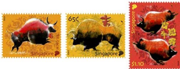
Complete set of stamps (S$2.01)