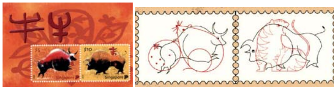
Collectors' Sheet printed using Offset Lithography with high reflective index transparent hologram with morphing effect (S$16.80)