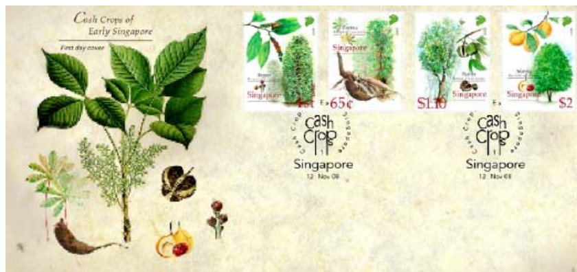
Precancelled First Day Cover affixed with complete set of stamps (Price: S$4.90)