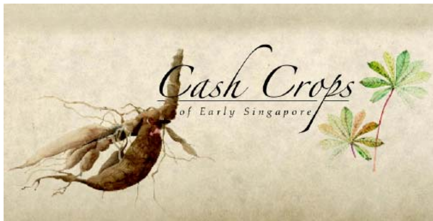
Presentation Pack (Price: S$5.90)