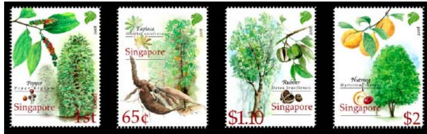
Complete set of stamps (Price: S$4.01)