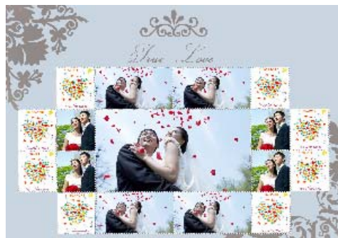
Special Edition Personalised MyStamp sheet with 8 stamps