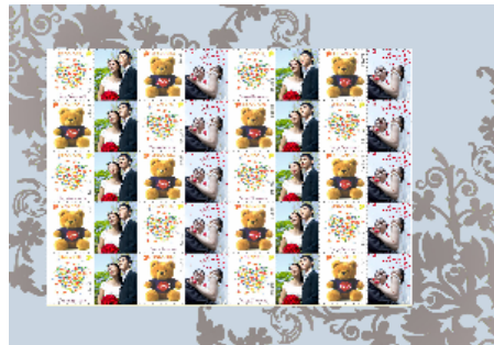
Wedding MyStamp A4 personalised stamp sheets with 20 stamps