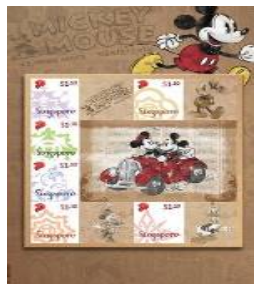
Classic Mickey Decorative MyStamp