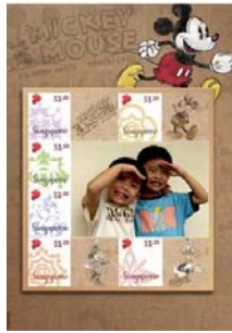
Classic Mickey Personalised MyStamp

Singapore, 8 October 2008 - From 9 October to 31 December 2008, Singapore Post Limited (SingPost) is offering its customers the opportunity to win a pair of tickets to their dream destination with every purchase of SingPost's latest MyStamp issue - the Mickey Around the World MyStamp Collection.