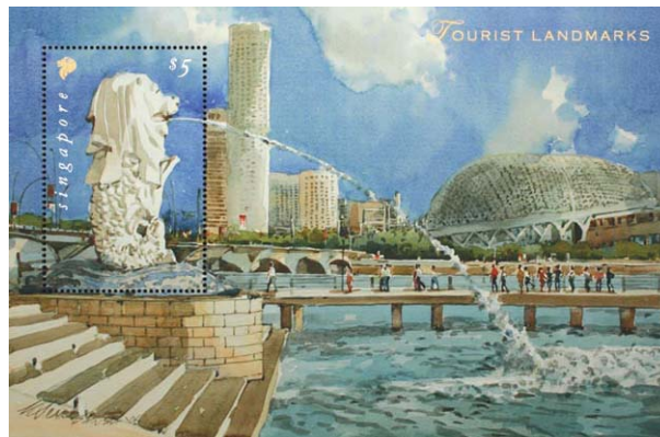
Precancelled First Day Cover (top) and Miniature Sheet (bottom)

Singapore, 7 August 2007 – Chinatown, Kampong Glam, Little India and Orchard Road, all iconic tourist landmarks of Singapore which best define the country's multi-cultural history, character and dynamism to the millions of tourists who visit each year, provide the theme for the stamp issue commemorating the nation's 42 nd National Day this year.