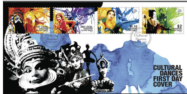
Pre-cancelled First Day Cover

Singapore, 15 May 2007 – Singapore’s multi-ethnic society showcases a rich kaleidoscope of cultural dances – Chinese, Indian, Eurasian and Western, and Malay – which are vividly captured on this new stamp issue.