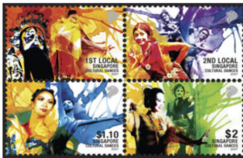
Complete set of stamps