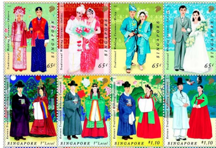
Complete set of stamps