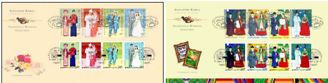
Set of 2 Commemorative Covers

Singapore, 26 March 2007 – The traditional wedding costumes of Singapore and Korea, in their rich colours and joyous splendour, will be featured on the joint stamp issue of Singapore Post (SingPost) and Korea Post to be released on 30 Mar 07. This is to mark the growing interest of both Singaporeans and Koreans in one another’s culture and history over the recent years. This is also the first major collaboration between SingPost and Korea Post.