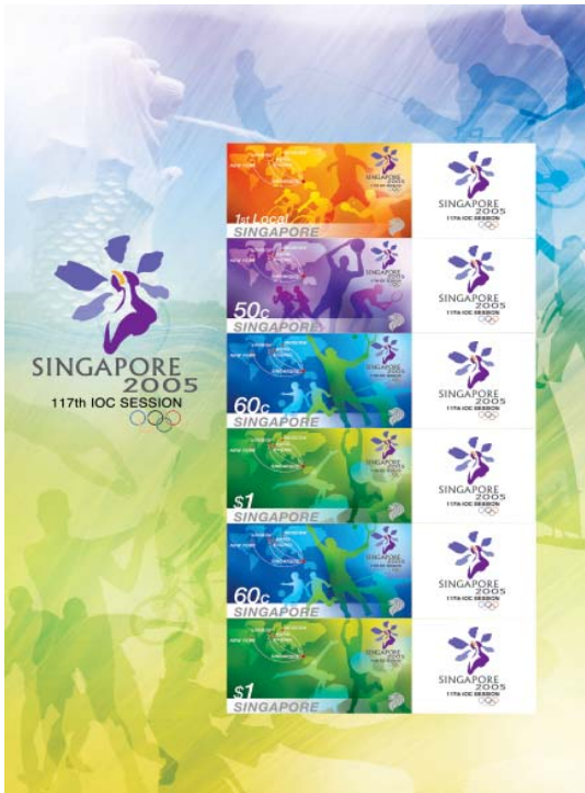
IOC MyStamp with decorative tabs

Singapore Post Limited (Reg. No. 199201623M) 10 Eunos Road 8 Singapore Post Centre Singapore 408600