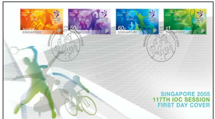
Pre-cancelled First Day Cover ($2.60)

Singapore, 1 July 2005 - Come July this year, Singapore will be abuzz with excitement as eminent individuals from the world of sports, business, politics and royalty will converge in Singapore to attend the 117 th International Olympic Committee (IOC) Session. The annual IOC Session is a gathering of IOC Members. The IOC discusses reports presented by upcoming Olympic Games Committees, IOC Commissions, and matters relating to sports, as well as makes decisions on bids for hosting various games.