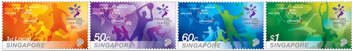
Set of 4 stamps ($2.33)