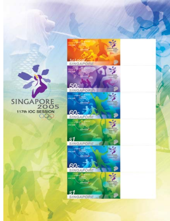
IOC MyStamp for personalization