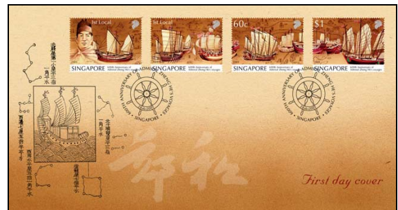
Pre-cancelled First Day Cover ($2.60)