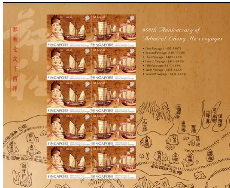
Collector's Sheet – S$2.40