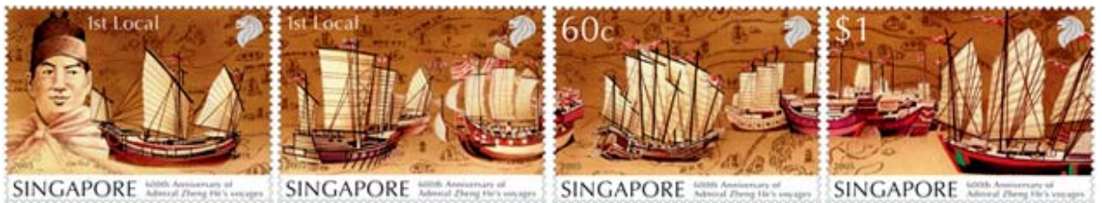
Set of 4 stamps ($2.06)