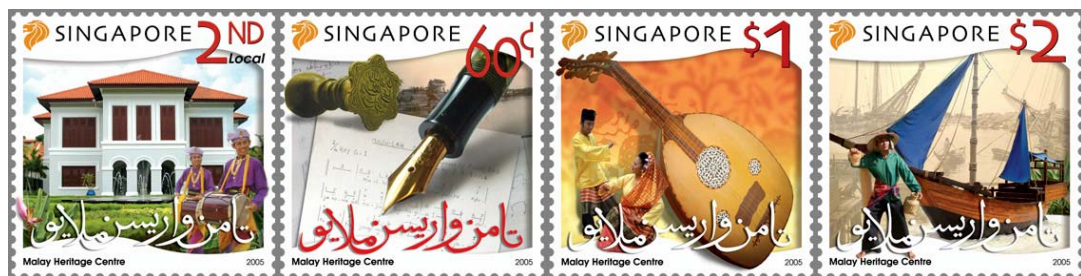
Set of 4 stamps ($3.83)